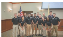
SGA meeting addresses courtesy

Camden man arrested after incident on Rowan Boulevard A quiet Tuesday night in town turned rowdy Tuesday evening as officers from the Glassboro Police Department engaged in an incident with a suspect who September 13, 2017 The "Whit Online"