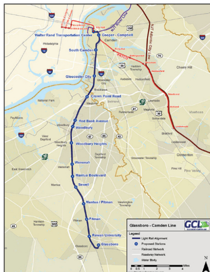
Map of the GCL railway through Gloucester and Camden counties.

The GCL would span 18 miles and connect Camden to Glassboro through diesel light rail vehicles (DLRVs) along 14 stations. Sponsored by DRPA, PATCO and NJ Transit, the GCL would effectively connect Gloucester and Camden counties in New Jersey to Philadelphia, Pennsylvania through its connection to the Walter Rand Transportation Center in Camden.