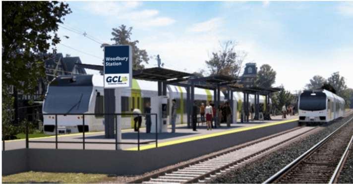
The GCL would span 18 miles and connect Camden and Glassboro to Philadelphia through diesel light rail vehicles (DLRVs) along 14 stations.

Following the release of an Environmental Impact Statement (EIS), two representatives for the Glassboro-Camden Line (GCL) construction project spoke during the Rowan University Student Government Association (SGA) Senate Meeting on Monday, March 22, before senators voted in favor of a resolution that supports the construction.