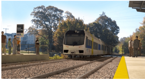
Render of the Rowan University station.