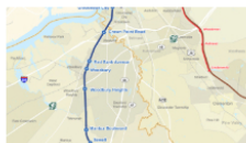
Rowan Students to Reap Benefits